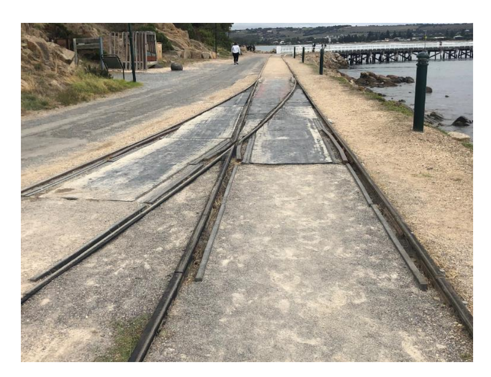
Figure 3.6: Typical Fixed Blade Turnout