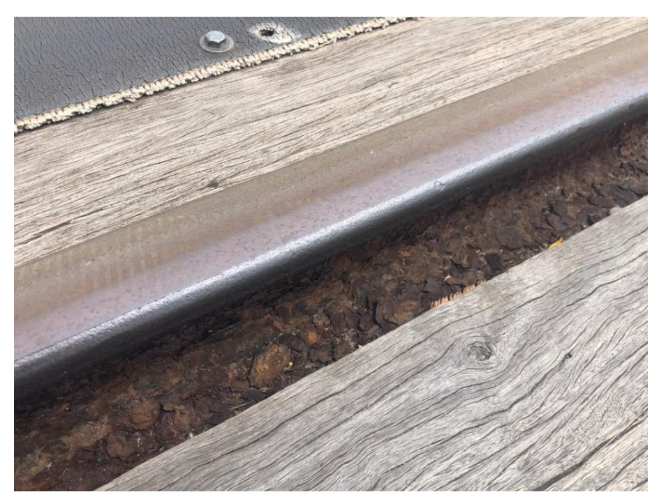
Figure 3.2: Corroded Rail Foot and Web

On 14 March 2020, VHHTA volunteer Kim Bayly identified a location in the rail on the Victor Harbor end of the causeway where corrosion had resulted in a penetration of the web. Figure 3.3 illustrates the web penetration in this track section.