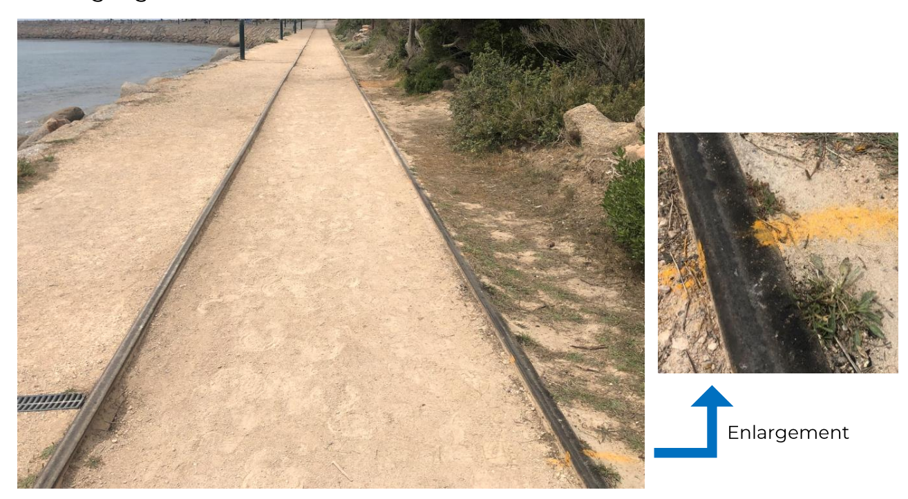
Figure 3.4: Typical Track on Granite Island with Marked Gauge Measurement Location

As an improvement, it is suggested that the VHHTA adopt a regular frequency for monitoring, potentially monthly, to improve regularity of measuring and provide further confidence in the state of the track gauge. This frequency could be reduced in dry seasons if consistent measurements are recorded indicating stable gauge.