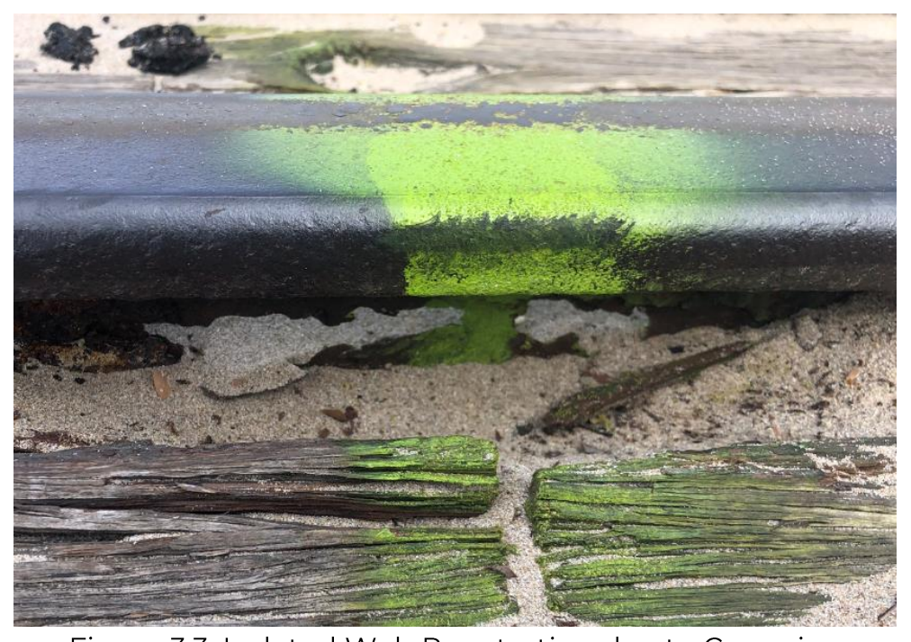
Figure 3.3: Isolated Web Penetration due to Corrosion

On 14 March 2020, VHHTA volunteer Kim Bayly identified a location in the rail on the Victor Harbor end of the causeway where corrosion had resulted in a penetration of the web. Figure 3.3 illustrates the web penetration in this track section.