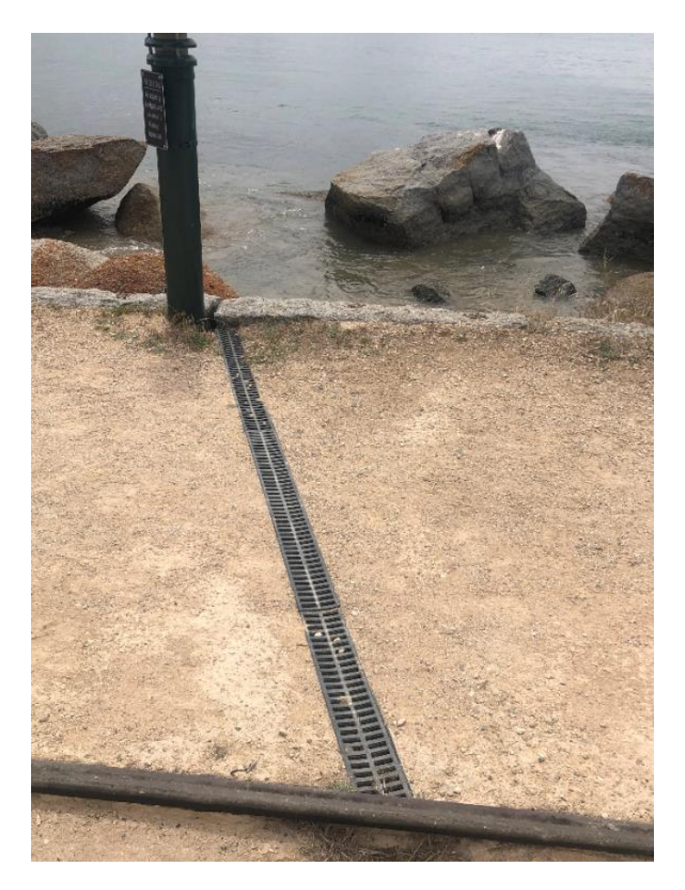
Figure 3.5: Typical Grated Drain