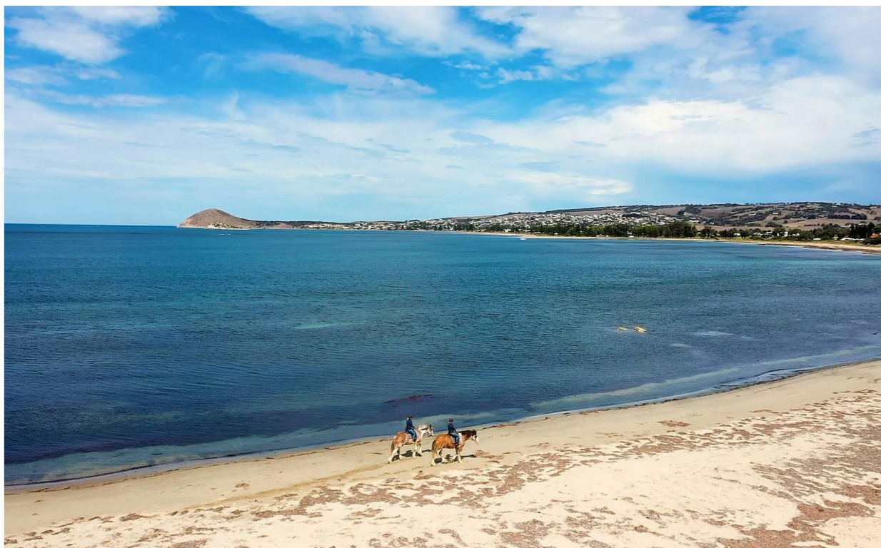
Jay Jay and Albert enjoying some long and leisurely beach exercise.

The rest of the horse team are performing amazingly well and haven't missed a beat during the challenges thrown at them due to the new causeway build, which is well underway. It can't be overstated how proud the team is of the way the horses have handled the new, and ever changing, conditions. The horses all had their annual veterinary examinations, and the VHHTA is beyond pleased to announce that all of the horses had fantastic health results and the horse team as a whole were given 'five stars' for health and fitness and were said to be in the best condition yet. ★★★★★